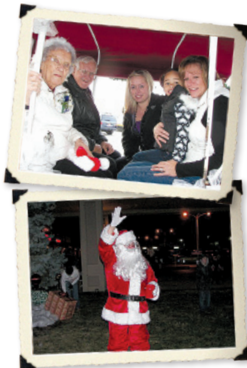
Photo bottom right: Santa Claus making his grand appearance in the city of Riverside.